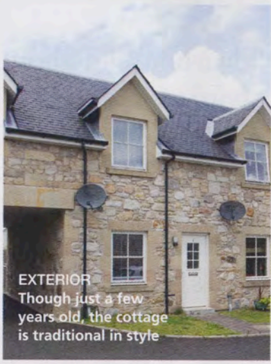
EXTERIOR Though just a few years old, the cottage is traditional in style